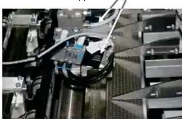
DMP-100 Rotary perforator knife actuators